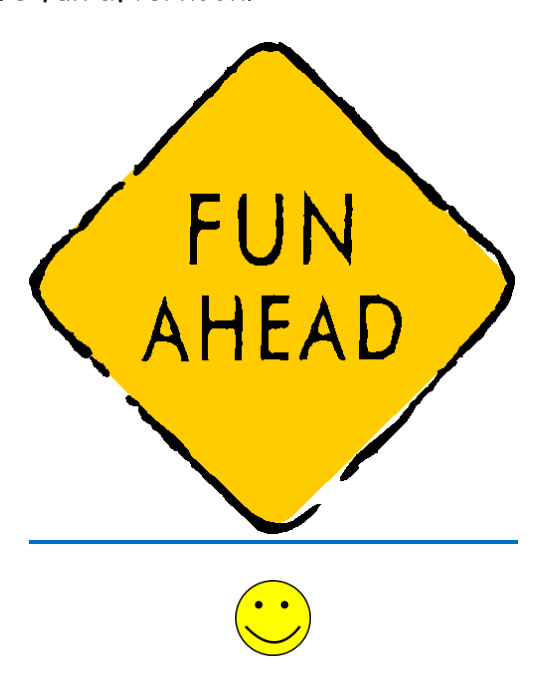
"I don't do drugs. I get the same effect by standing up real fast...."

Refreshments will be served at the Museum during and following the Art Show. Please consider joining us for this fun afternoon!