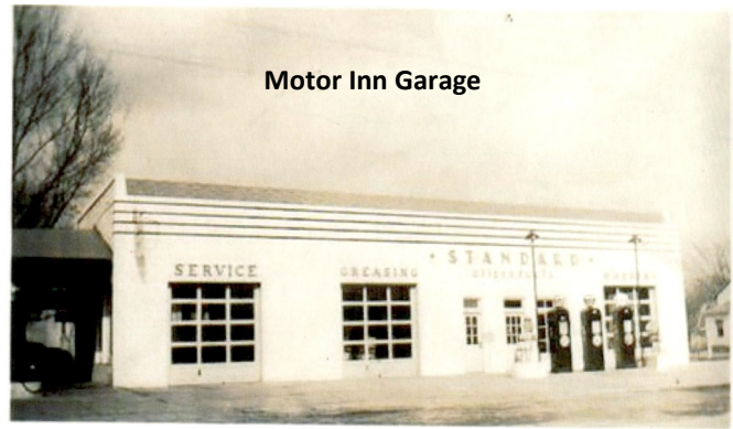
Motor Inn Garage