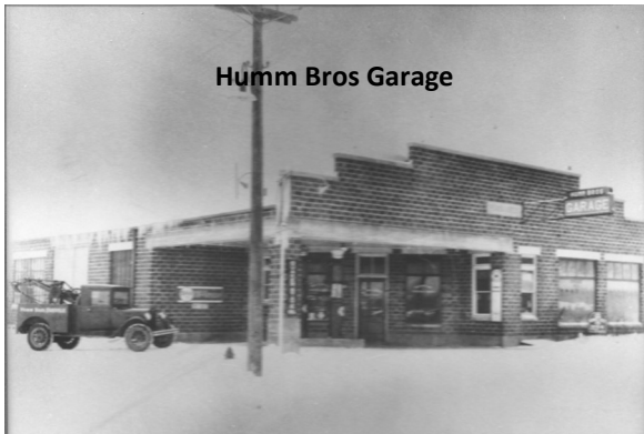
Humm Bros Garage