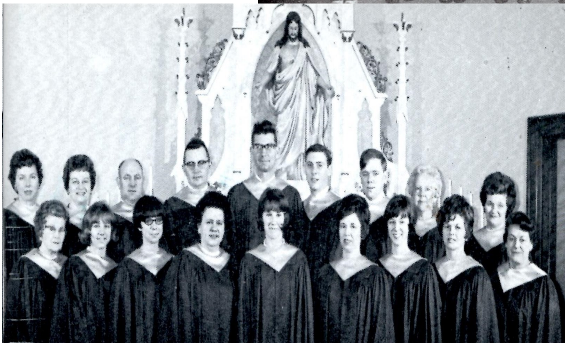
Senior Choir Lutheran Church ~1967